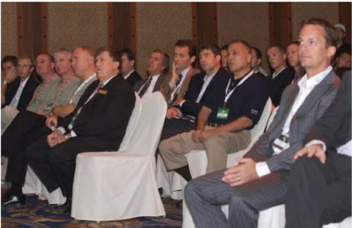
GolfEx Conference delegates