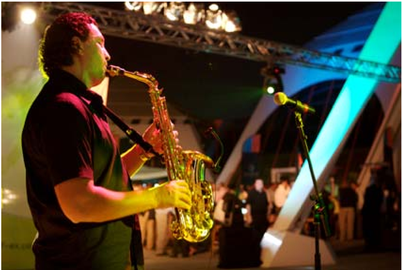
'PARTY ON THE GREEN'