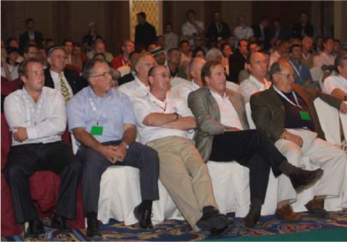
GolfEx Delegates listen intently to the debate on Signature vs. Non-Signature Design