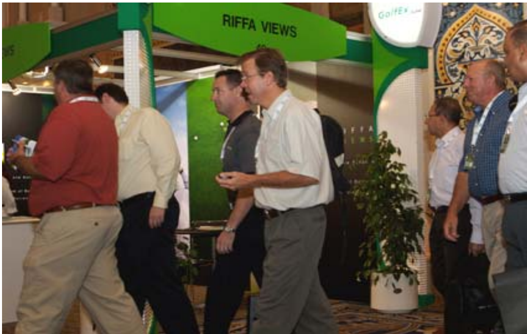
GolfEx Exhibition Hall