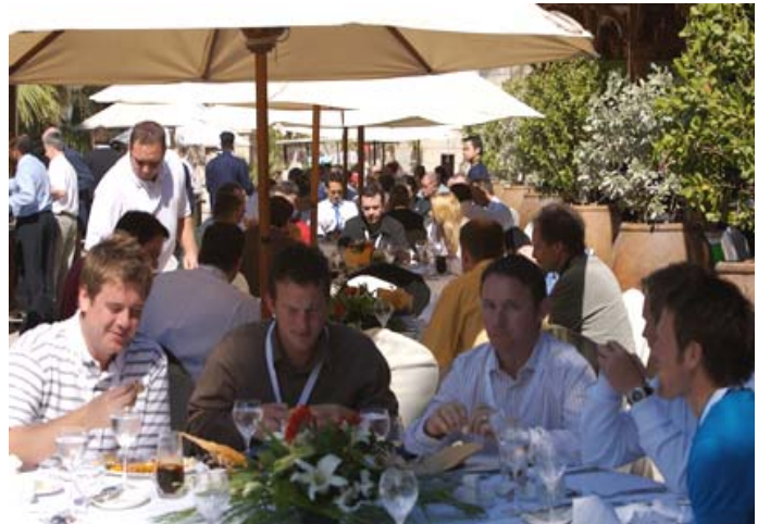
Time for some sun and networking over a lunch buffet on the Water Terrace