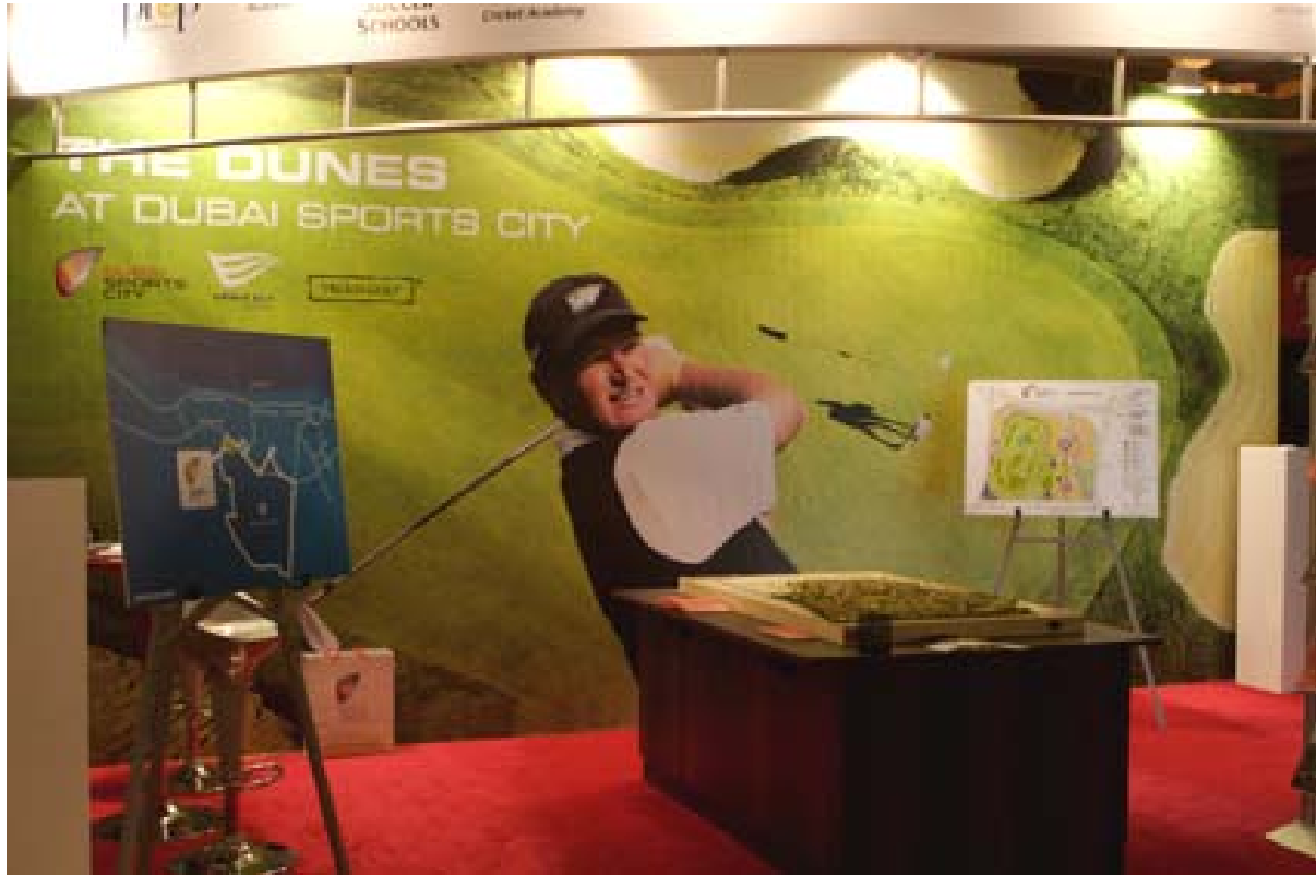
Dubai Sports City Exhibition Stand