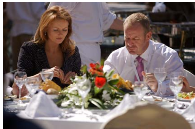
Water Terrace Luncheon for added networking